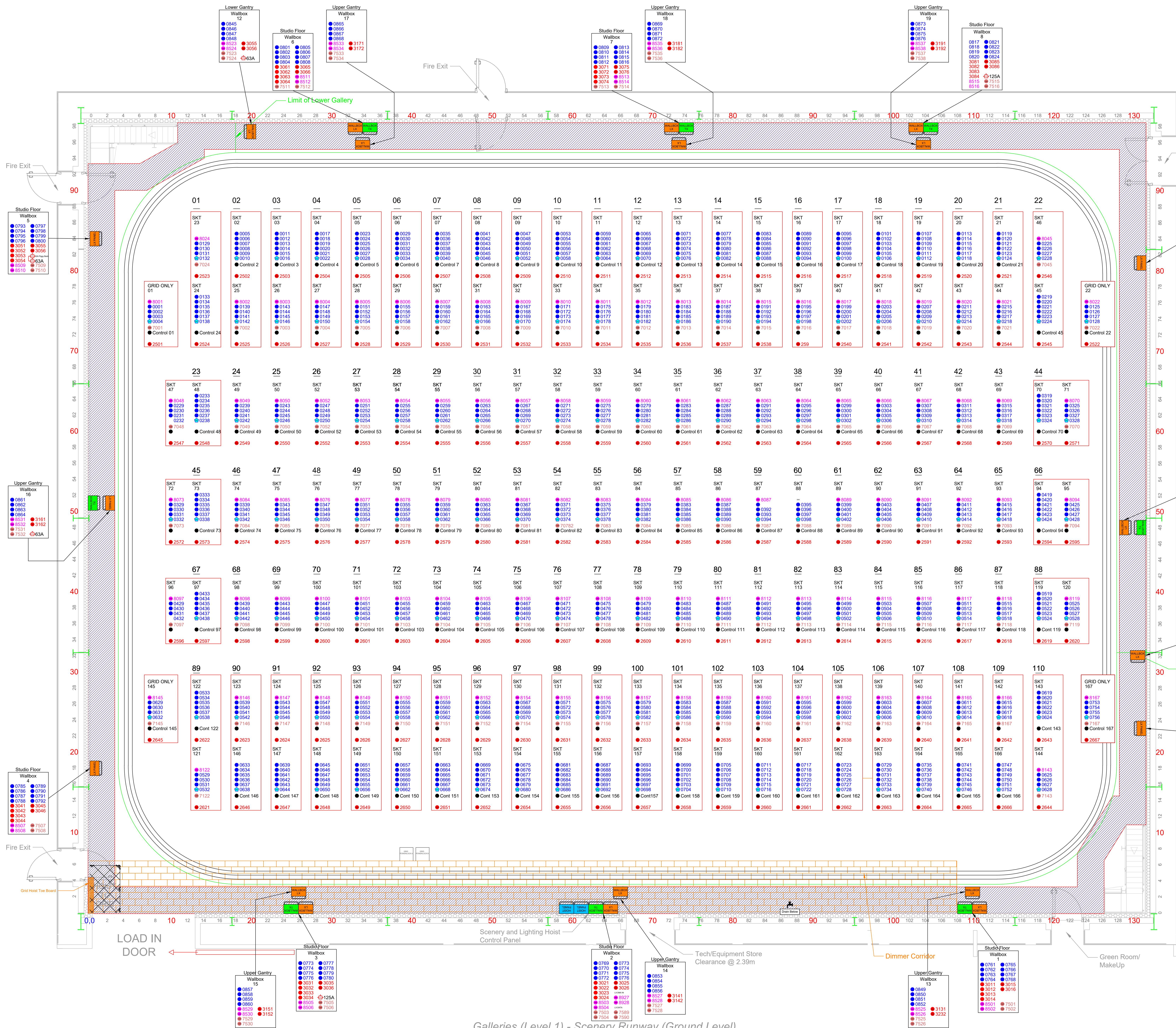
Galleries (Level 1) - Scenery Runway (Ground Level)